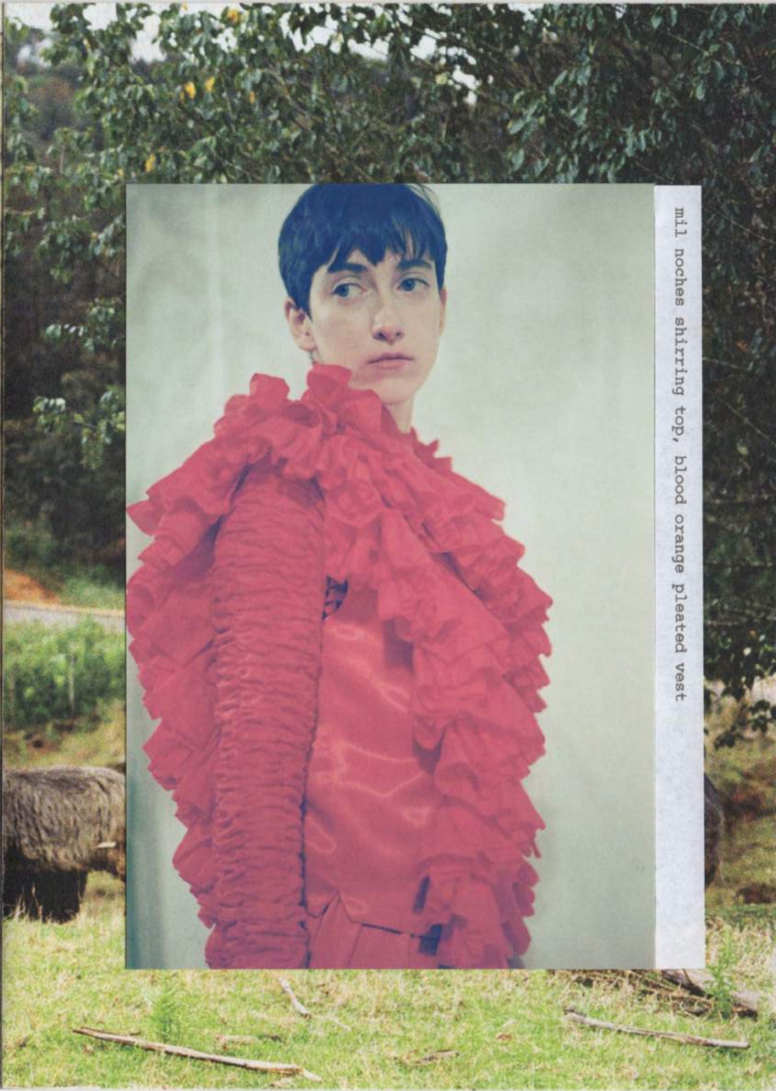
mil noches shirring top, blood orange pleated vest