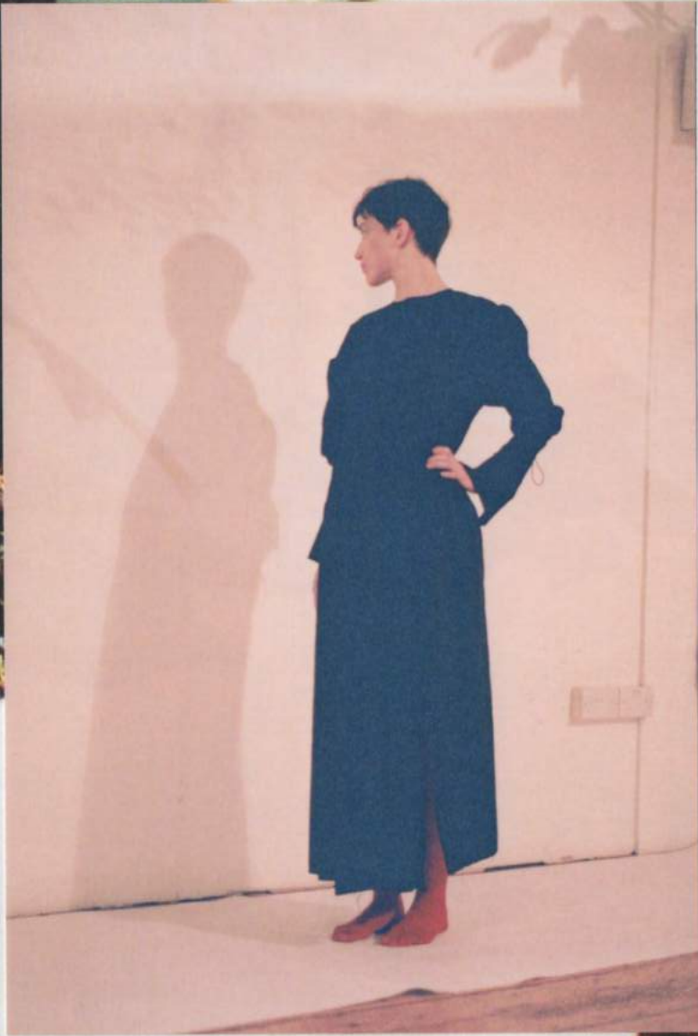
black triple dress