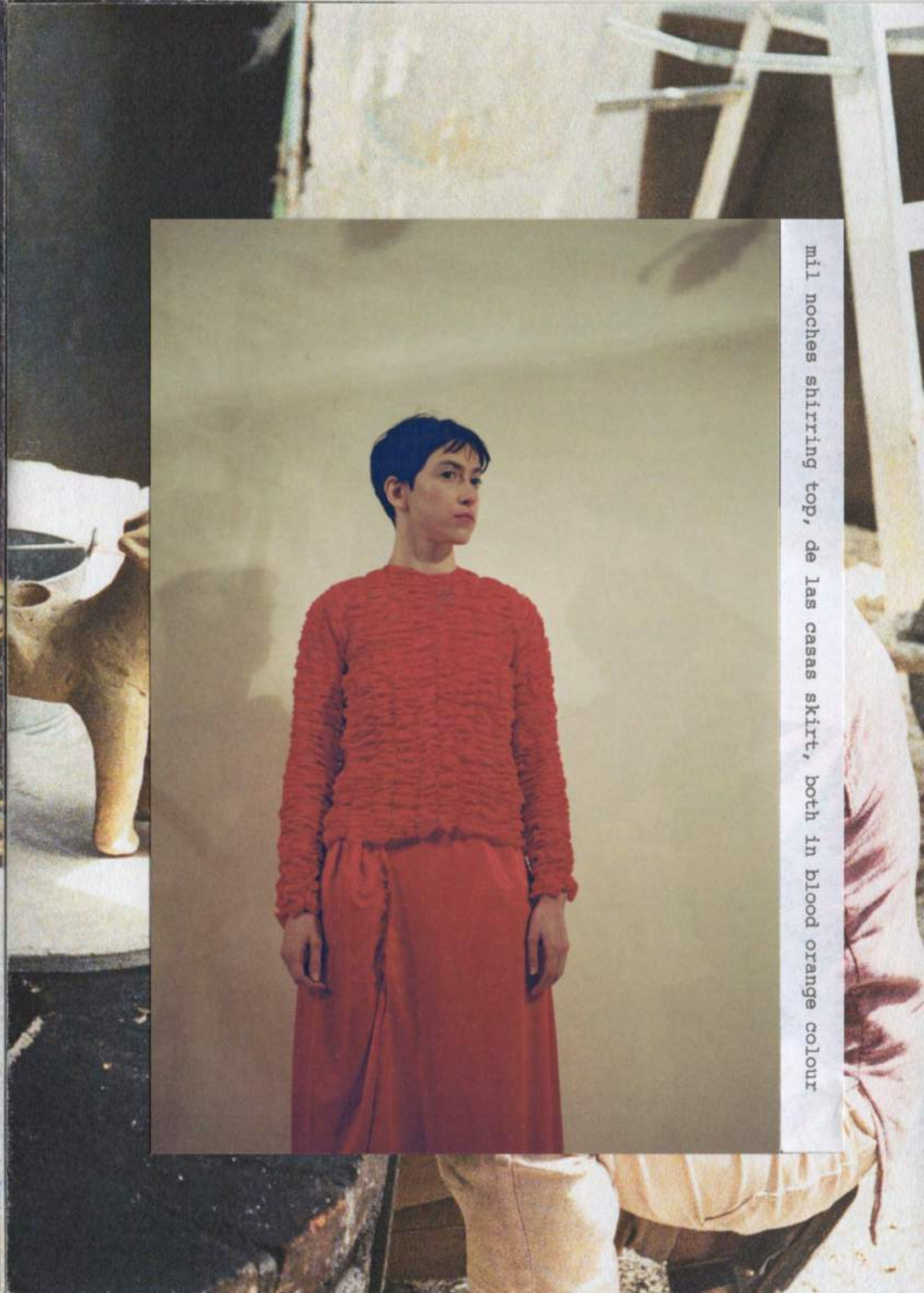
mil noches shirring top, de las casas skirt, both in blood orange colour