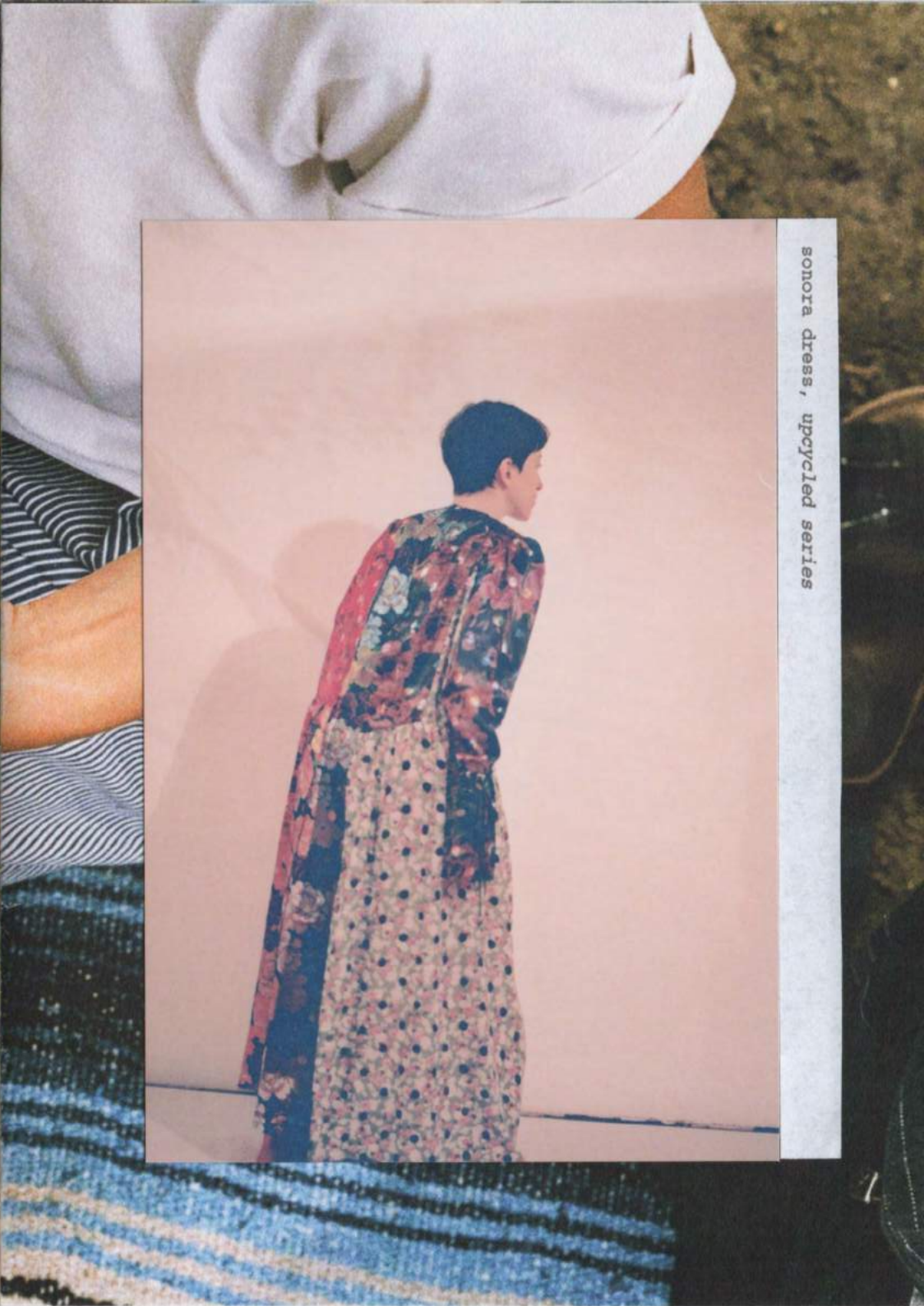
sonora dress, upcycled series