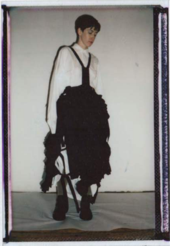
shaman shirt, zapatista artisanal skirt