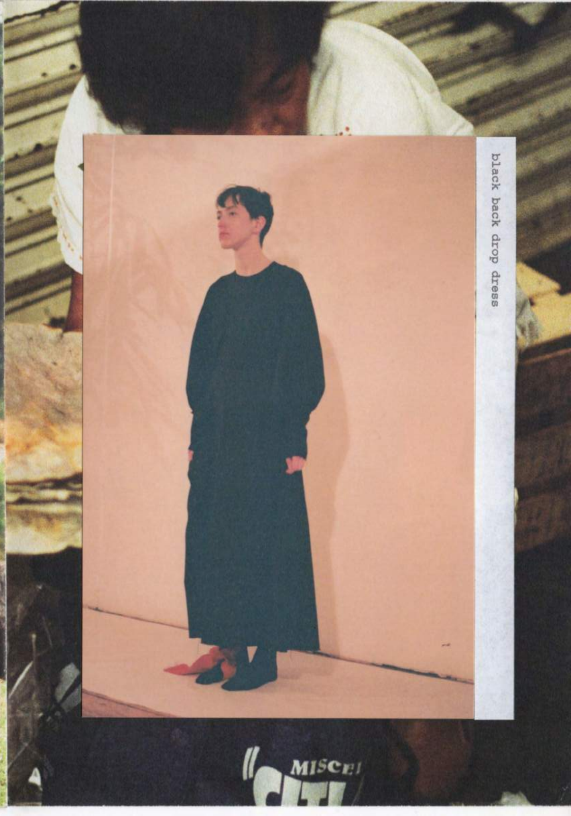
black back drop dress