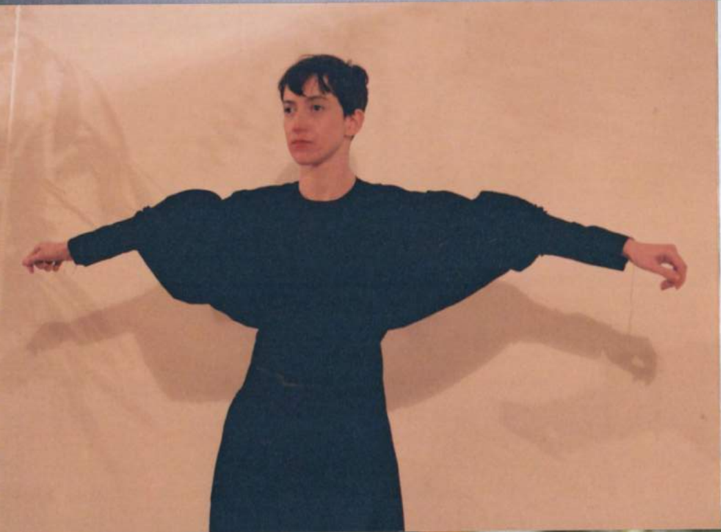
black back drop dress