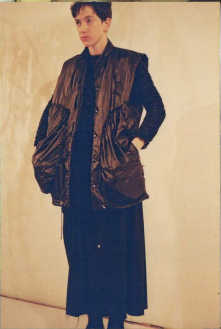
mil noches shirring top, de las casas skirt, both in black; booster bag gilet jacket