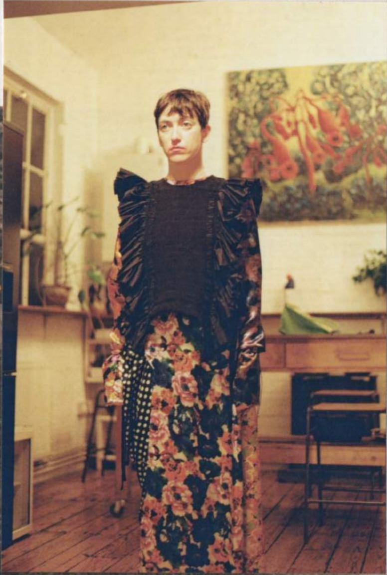
sonora dress, upcycled series; 8.6m pleated vest