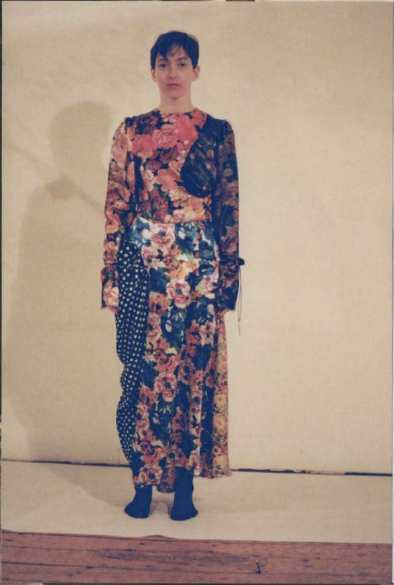
skandalo dress, upcycled series