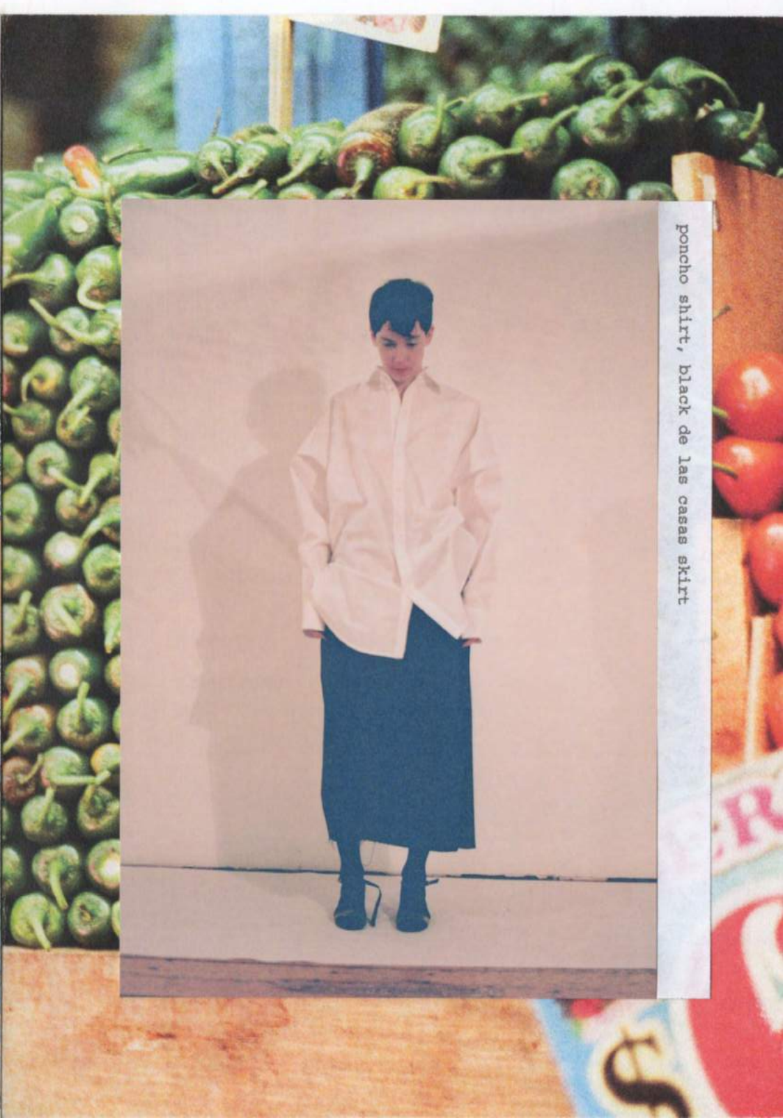
poncho shirt, black de las casas skirt