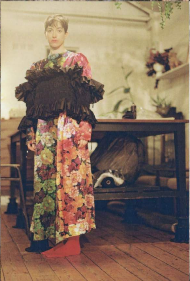
sonora dress, upcycled series; 12m black pleated top with sleeves