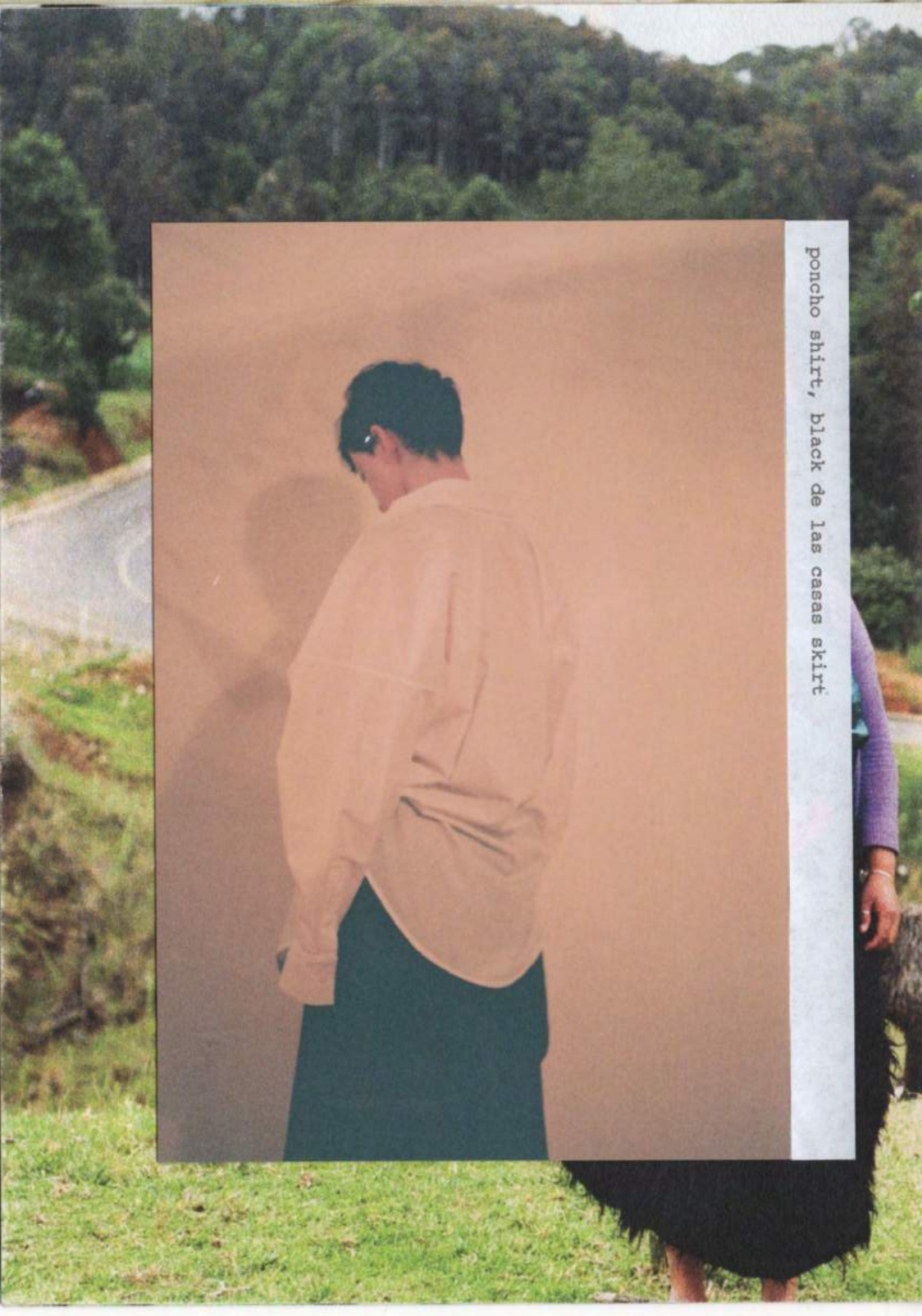
poncho shirt, black de las casas skirt