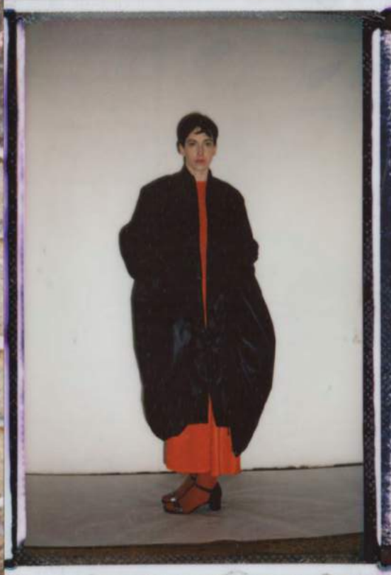
double blister long coat