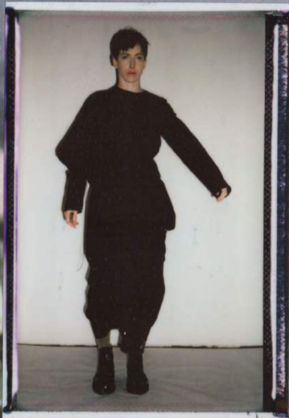
black chamula winter dress