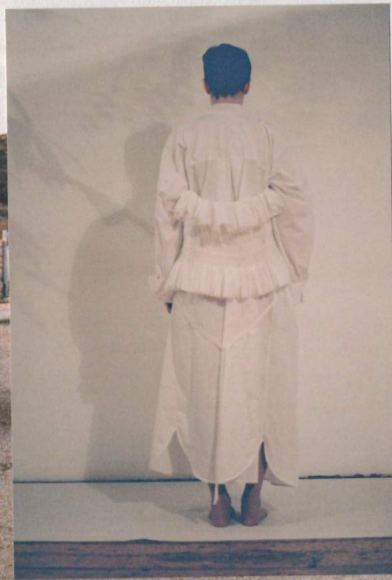
orisha shirt, 7.7m white pleated top