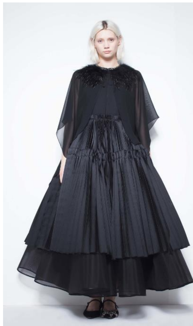
Vicki ZHAO × Dice Kayek FW17/18 Collection April 2017 – Hong Kong Film Festival - Hong Kong China