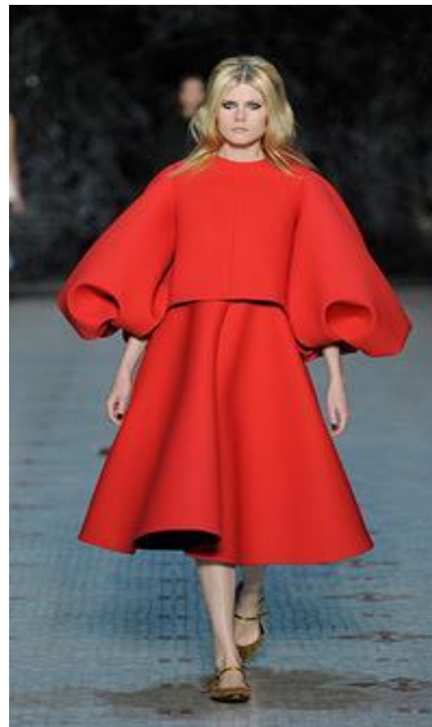
Fan Bingbing × Dice Kayek Spring 2016 Couture JUNE 2016 -19th Annual Shanghai International Film Festival - SHANGHAI CHINA 范冰冰 × Dice Kayek 2016 春季高级定制