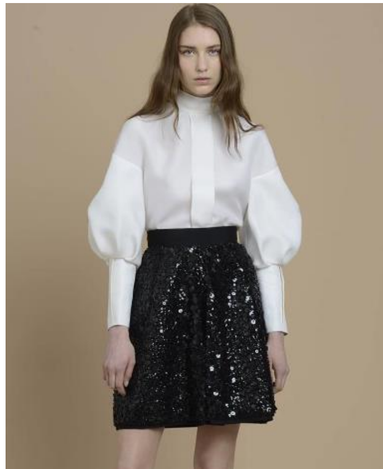
LI Yuchun × Dice Kayek FW16 Prêt à Porter JULY 2016 -VOGUE CHINA - CHINA