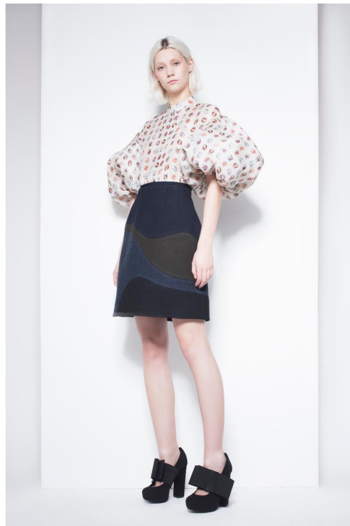
Coulee Nazha × Dice Kayek FW17/18 Collection Oct. 2017 – ROADSHOW “CITY OF ROCK” (电影缝纫机乐队路演)- Fuzhou China 古力娜扎 × Dice Kayek 2017/18 秋冬成衣系列