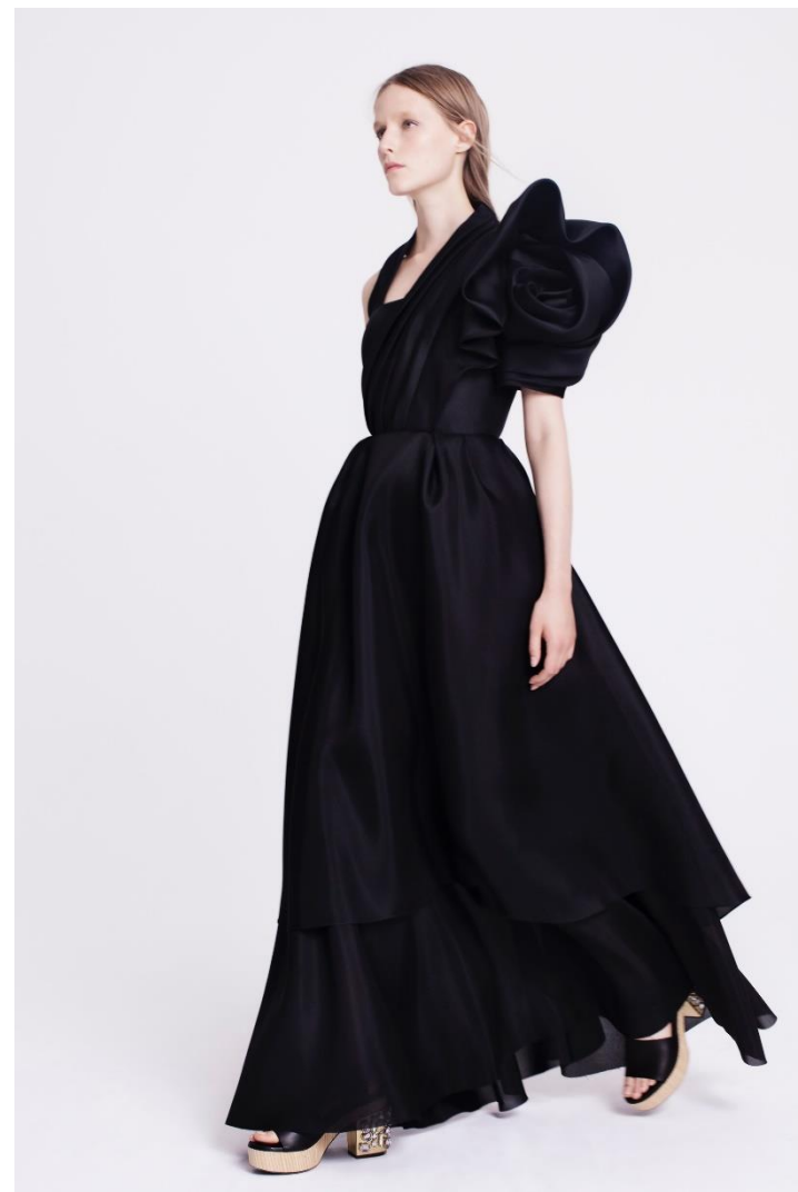
QIN Lan × Dice Kayek RESORT 18 Collection Oct. 2017 – Elle STYLE AWARDS 2017 - Shanghai China 秦岚 × Dice Kayek 2018 早春成衣系列