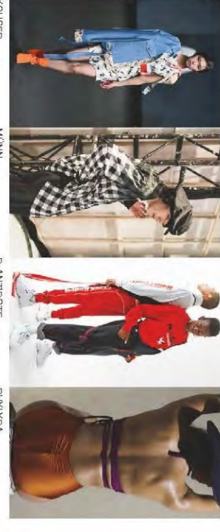
WOMEN'S WEAR MEN'S WEAR PREMIUM TALENTS AWARDS SPECIAL FASHION ACCESSORIES

THIS SEASON'S WINNERS AND THE NEXT PREMIUM YOUNG TALENTS AT PREMIUM BERLIN