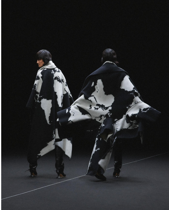
Earth map jacquard blanket coat