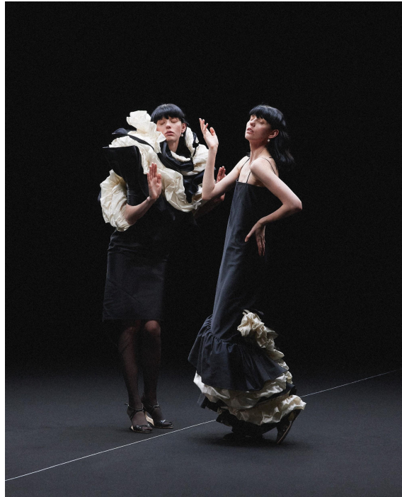
Ruffled dress inspired by 50s Cristobal Balenciaga's Haute Couture