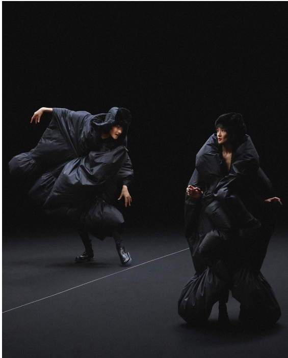
360° Flip around down coat to a Down Dress