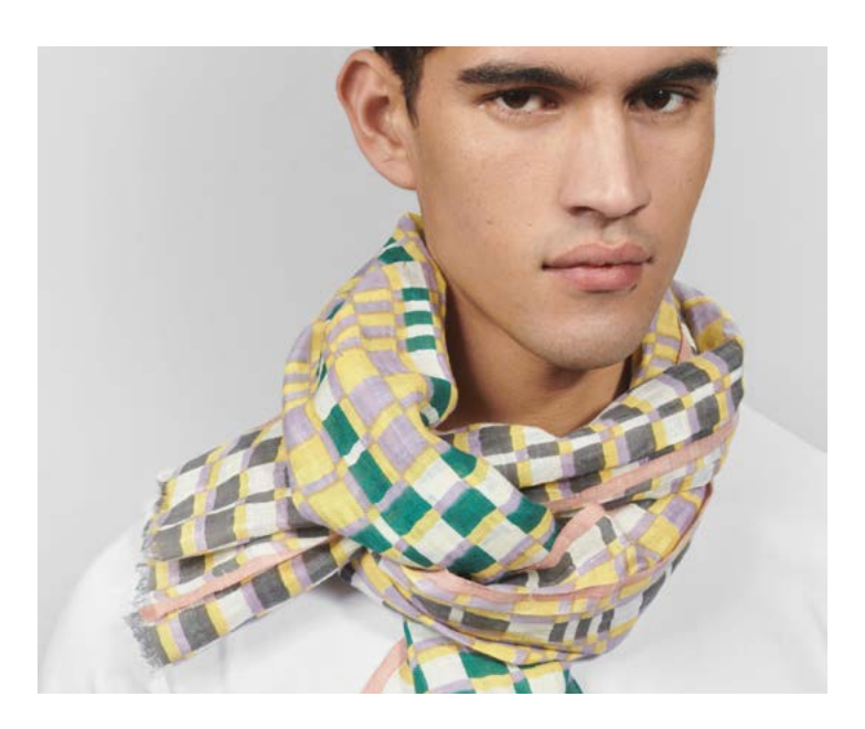
The brand's universe is imbued with its sense of perfection and creativity.

The tones that characterize Epice are the exact reflection of these shades close to the washes so particular to Scandinavia. These subtle shades can be found in the works of northern artists such as Michael Peter Ancher and Vihelm Hammershøi, as well as in the streets of a city like Copenhagen, where people favor color in their clothing as a sign of balance and energy.