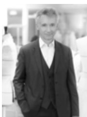
GEOFFROY DE LA BOURDONNAYE