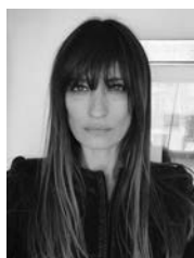
CAROLINE DE MAIGRET