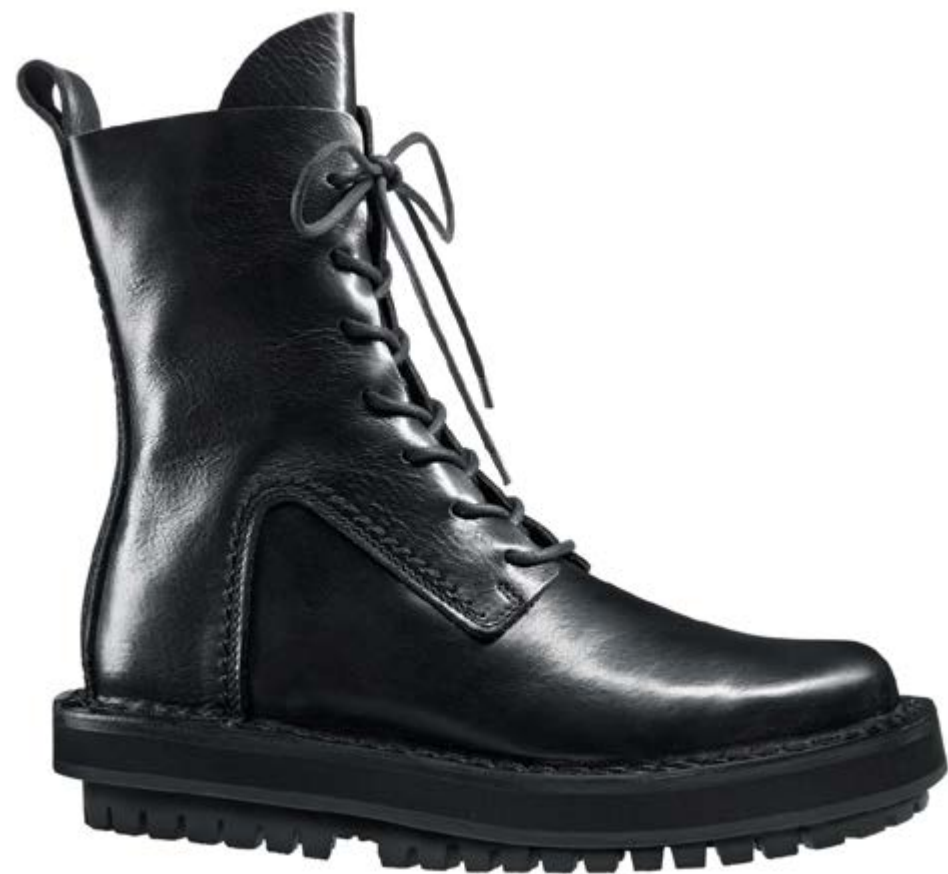
Tarone ♀ ♂