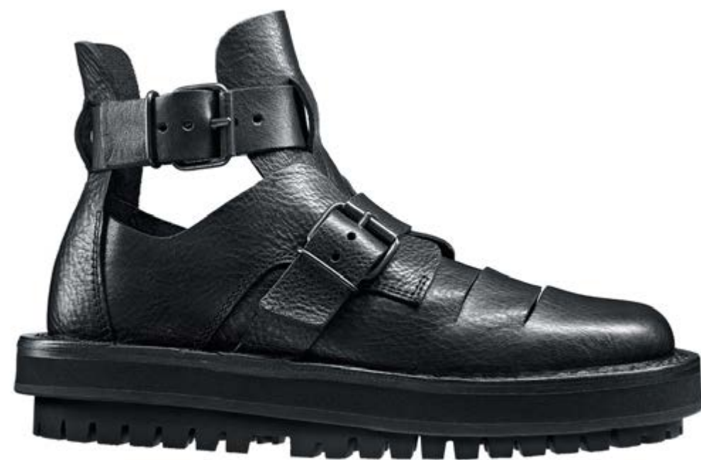
Rebel ♀ ♂