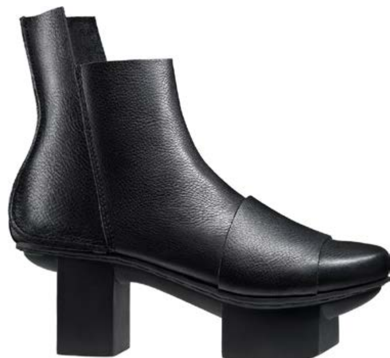
Metal ♀ ♂