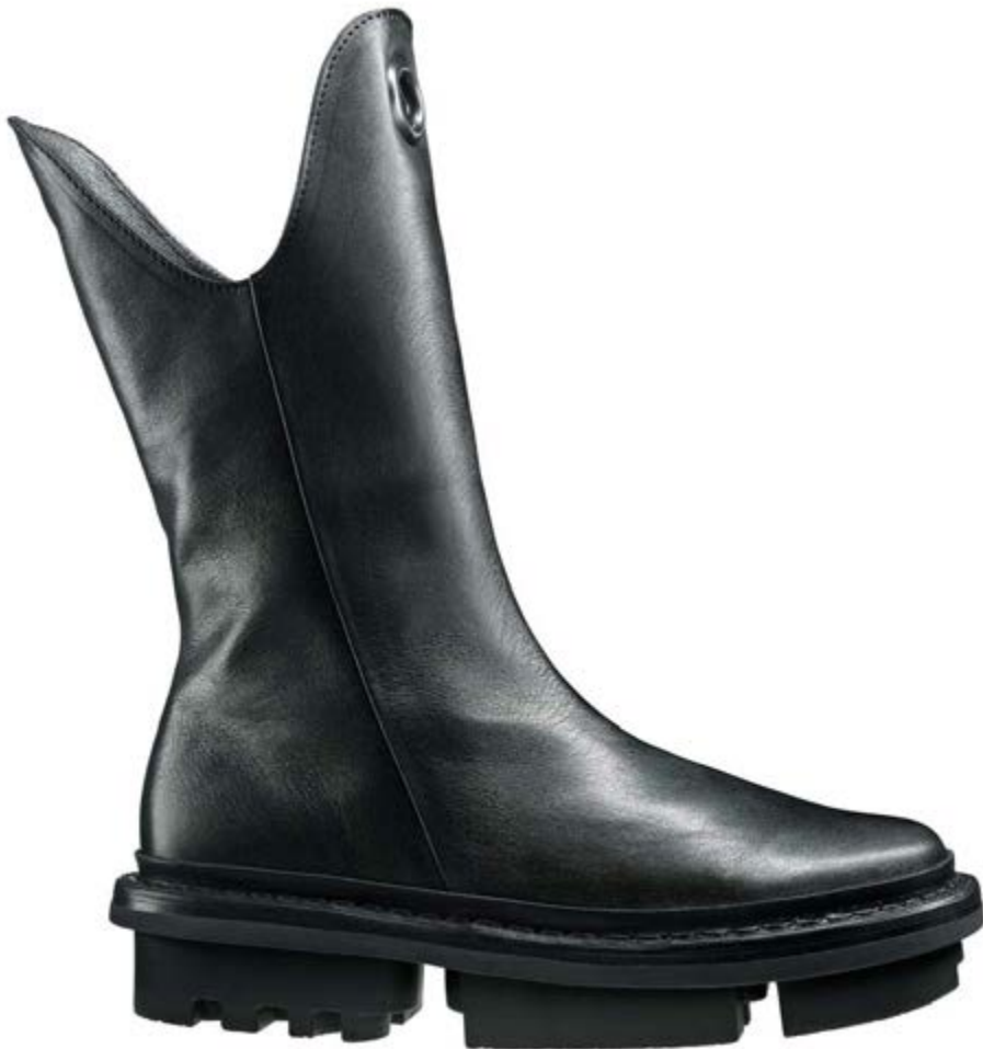
Ozzy ♀ ♂