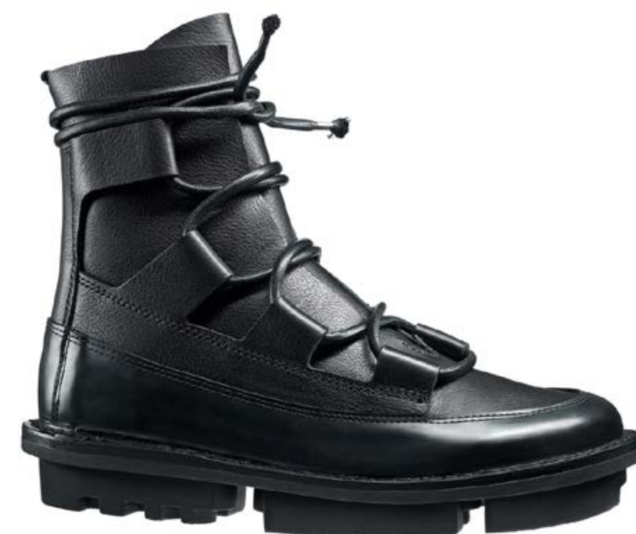
Proof ♀ ♂