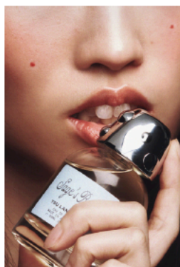
TSU LANGE YOR